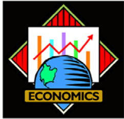
Microeconomics: Theory Through Applications